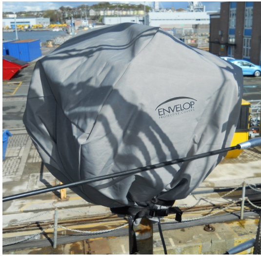
RN 250mm Searchlight 312074

In these times of austere budgets and an increased awareness of the Total Cost of Ownership (TCO) for naval vessels, Britain's Royal Navy is turning to Envelop® Protective Covers for both short and long term equipment protection. Until recently, Envelop® Protective Covers could only be found on the CIWS Systems on several large combatant and Royal Fleet Auxiliary (RFA)