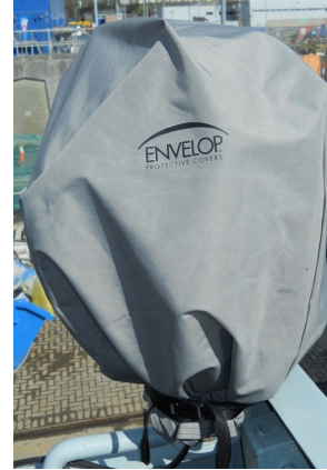
RN 300mm Searchlight

In addition to the Royal Navy, Envelop® Protective Covers are currently being used on ships of the Royal Canadian Navy, Royal Australian Navy, Royal New Zealand Navy, and the Japanese Maritime Self Defense Force.