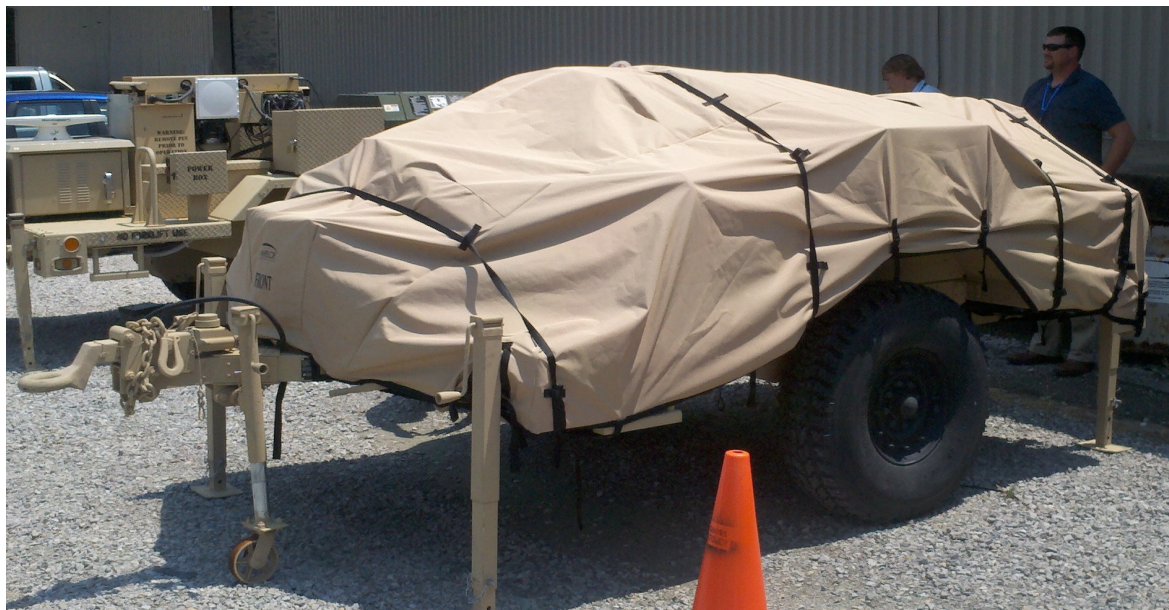
G-BOSS Lite- 123072

and effectiveness of this critical component while reducing maintenance expenditures and downtime.