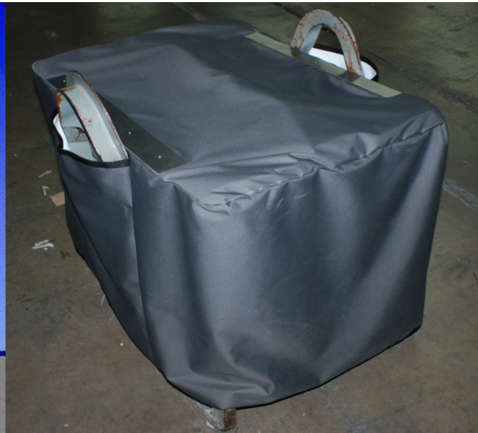
CAT Storage Bin