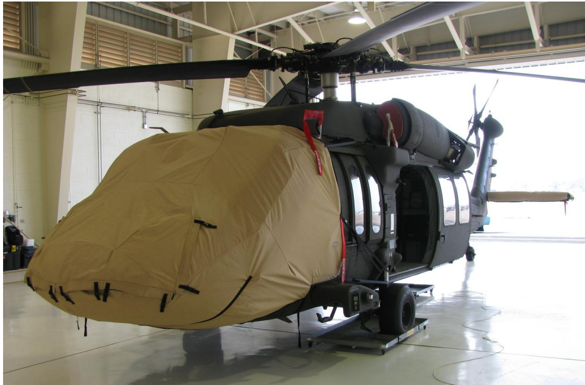
UH-60M Full Cockpit/Nose- 122037

maximize the benefits of Envelop's® protective qualities. This training is just one of the reasons Shield Technologies and Envelop® Protective Covers enjoy a reputation for providing a top quality product with superior customer service.