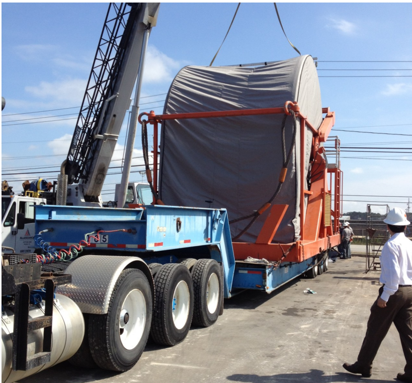
Coil Tubing Reel Cover

One of the largest companies in the Oil and Gas industry recently approached Shield Technologies about creating a cover to protect an extremely large coil tubing reel. The coil tubing is used during drilling and needs to withstand the immense pressure that occurs in this process. The Oil Company was having issues with the coil tubing passing the strenuous pressure testing required before it is allowed to be used in the drilling process. The harsh environment of the Gulf of Mexico was causing corrosion on the inside and outside of the tubing, causing it to fail the testing procedure.